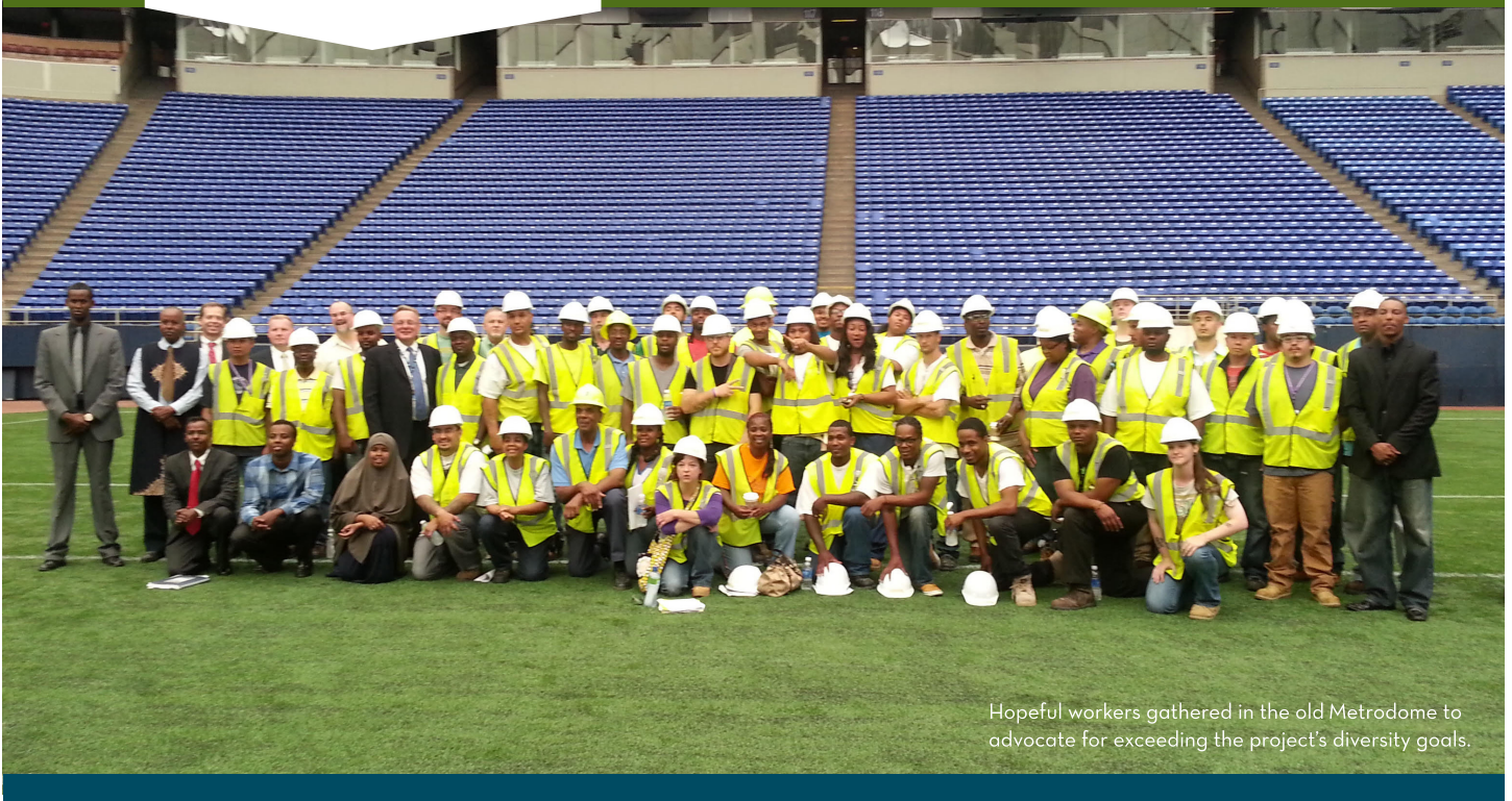
Hopeful workers gathered in the old Metrodome to advocate for exceeding the project's diversity goals.