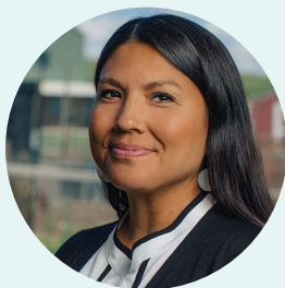
TATEWIN MEANS Thunder Valley CDC

“ When you go to Japan, you get off the plane and what do you see? Who are you gonna meet? You’re gonna meet Japanese people. If you go over to Africa you’re gonna see a lot of African people. Now, when you come to the United States, what are you seeing? I want that to be something you think about. Because we should be everywhere. Native Americans should be the largest population in New York, Los Angeles, you name it. We should outnumber everybody. So I always leave this as an open-ended question: What happened here? Because those were my relatives. Those were my people.”