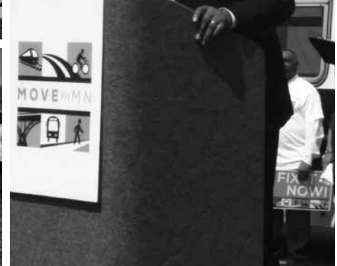
Alliance members and allies rally for equity.