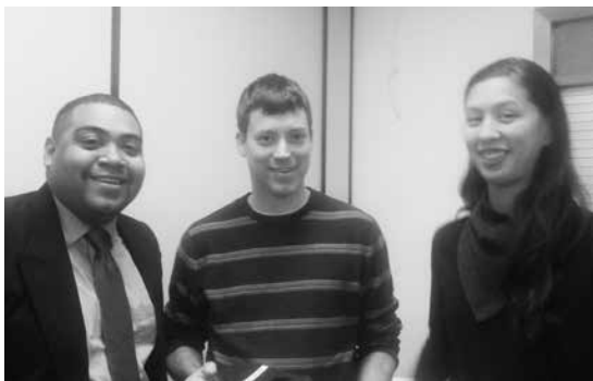
Members of the North Minneapolis Greenway Council

http://www.minneapolismn.gov/health/living/northminneapolisgreenway .